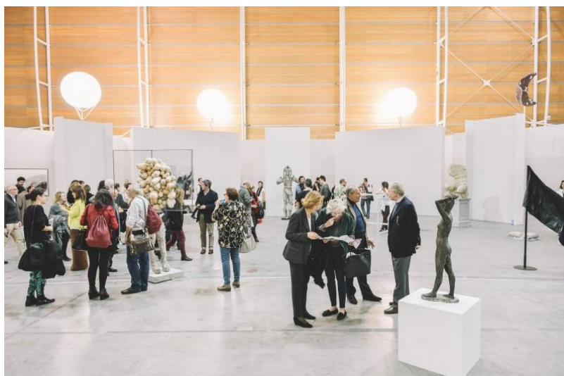
Artissima 2017

Exceptionally, a very reputable private club will open its doors to us for dinner, which will be an opportunity to taste some of the region's finest wines.