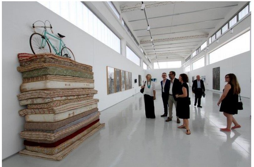
Collezione Ettore Fico