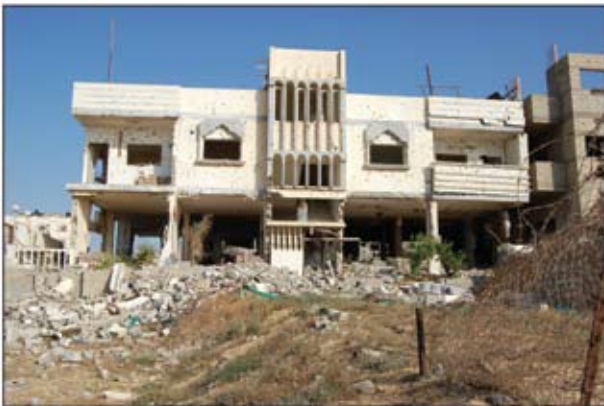
North of Al-Shati refugee camp, 170 m from the beach

His works are always fragile, subtle and intrinsically poetic. "It's a personal look. I'm interested in what codes and associations our minds refer