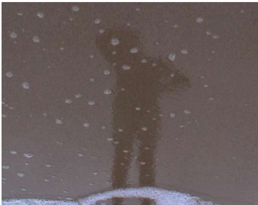
Facing page: Left: GH0809 , 2010. Plexiglas. 35 x 37 cm. Page one of a series of 103 digital prints. Right: GH0809 , 2010. Plexiglas. 35 x 37 cm. Page three of a series of 103 digital prints.

is GH0809 , a photographic body of work which stands for Gaza Houses 2008–09. Laden with irony, the 2010 series features images of Gazan ruins (after Operation Cast Lead in December 2008) marketed like real estate advertisements, selling seemingly perfect settings and unobstructed views. The series misleads one to assume that such a real estate agency actually exists. Batniji was not able to shoot the images of GH0809 himself due to the enforced blockade during the Israeli bombings on Gaza between December 2008 and January 2009. Instead, he asked journalist Sami Al-Ajrami to photograph the demolished houses; over 150 images were taken and information pertaining to 33 houses, either entirely demolished or partially destroyed, was gathered.